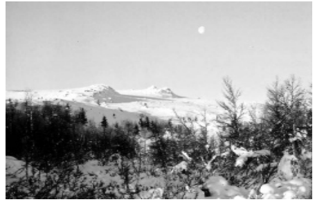
View from Astkyrkja

Anthony Bramante '06 and Rory Gawler '05 received a Schlitz Fund Grant in the fall of 2003 to spend two weeks in Norway ski touring from Lillehammer to the Rondane Mountains this past December. The following is an excerpt from their journal: