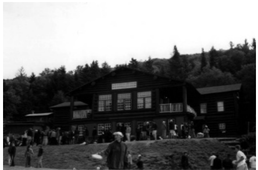
The Lodge on Fall Weekend

I opened my mouth to begin the answer I thought I knew: for the glory, for the self-discovery, to push the limits of human capability, to bag six peaks, to hike under the night sky. These were all reasons I had considered and thought justified my actions. I had given those reasons before, and was consistently told I was crazy. So I paused this time. I thought about all the insane, suicidal adventures people