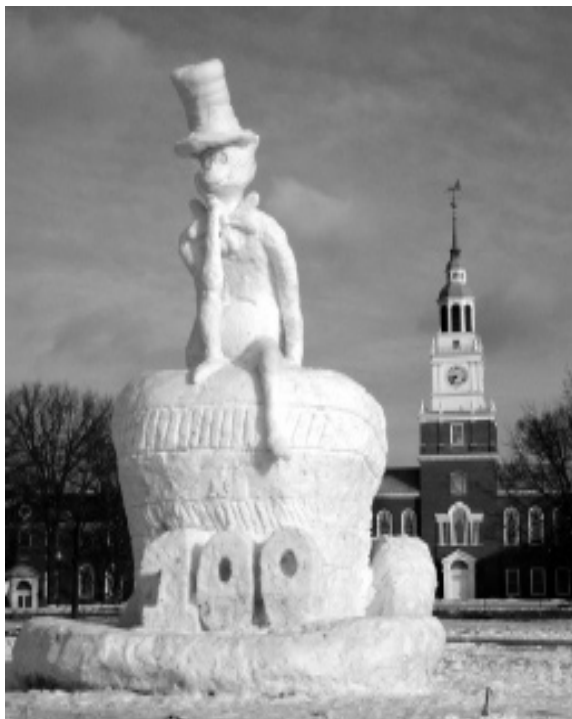
The snow sculpture dominates the Green with Baker Tower in the background.

Winter Carnival, themed "Oh, the Places It Snows," kicked off the multi-week celebration of Dr. Seuss's 100th birthday. Seuss, whose real name was Theodore Geisel, graduated from Dartmouth in 1925. His fun and imaginative spirit set the tone for a Winter Carnival that will go down in history.