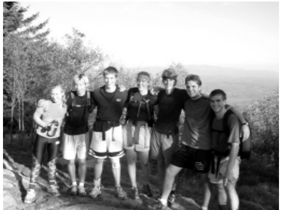
The author, right, with his group on Moose Mountain

It's called the Fifty Miler, and this past fall I was lucky enough to win a lottery spot to go on the hike; fifty other people wanted to go, but there wasn't room. That's right, I was lucky. I was lucky to have the opportunity to turn myself into a stumbling, moaning, rancid shell of a man. As I charged up that last stretch to Moosilauke's pinnacle, I was beginning to understand why. When I took those last few steps to 4,802 feet, my senses came back. I walked straight to the highest point and stood there. It was as if my eyes opened for the first time. The valleys below me were glowing orange with fall colors, where birds chirped as they flew around and people lounged about, talking, eating, laughing. It was a good day to be alive. Barely visible as a small bump amidst the haze on the southern horizon was Smarts Mountain. At twenty-five miles away it was the halfway point on the hike. I looked east, down the slopes of the