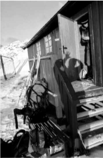
The porch of Rondvassbu hut

When we finally reached the summit of Astkyrkja, the sun broke through the horizon. An amazing dome of color towered over us. In the south, the sun's light bathed the world in fiery reds and deep burnt-oranges. The colors faded to yellow and then light blue directly above us before plunging into a sea of deep murky blues and purples punctuated by an occasional cloud and the bright, setting moon. And finally, in the north the white-capped mountains silently waited. A breathtaking rainbow of color stretched horizon to horizon as we plodded along underneath.."